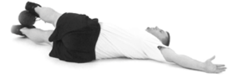
Straight Leg Spinal Twist