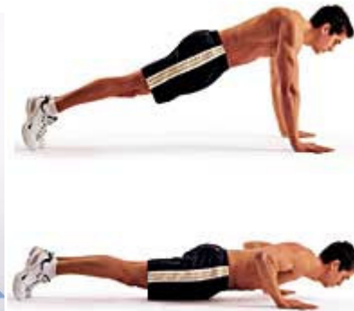
Press Up on Toes