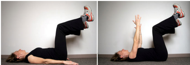
Bent Knee Leg Lifts/Dead Bug