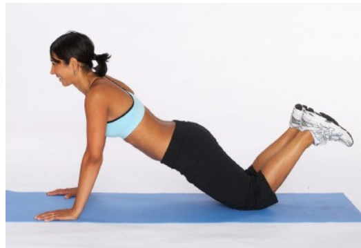
Press Up on Knees