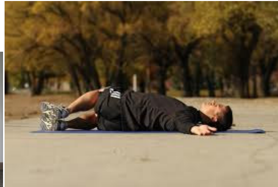
Bent Knee Spinal Twist